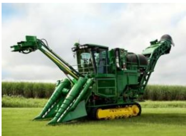
A clean harvester

I recently attended the Productivity Services Conference in Ballina-NSW. One of the last sessions was about the legal requirement for farm machinery moving into or out of quarantine zones to be inspected and a permit issued prior to the machine moving off the farm. It seems that in some other areas the high level of cleanliness required has slipped- harvesters etc arriving “pretty dirty”. Our area has been good, certainly with equipment leaving. This note is a courteous reminder though to all who wish to send machinery to notify myself so I can inspect and issue the correct paperwork. Biosecurity Queensland are expected to ramp up their level of attention to this situation after some of the complaints in Nth Queensland. In conclusion I would like to say how pleased I am at the level of initial cleanliness of the machines I am asked to inspect. This helps so much with regard to minimising travel time to and from a farm to re-inspect.