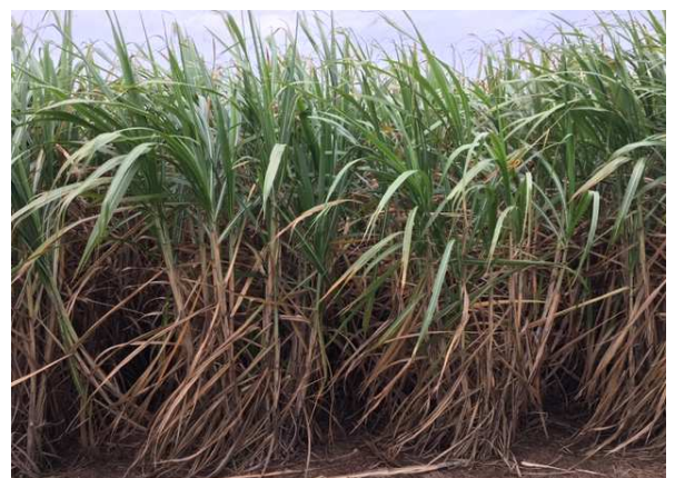
SRA 4 Second Ratoon

SRA4: Comparable with Q208 in variety trials (pg 6 2018/19 Variety Guide Sth Region). Q138 in parentage. Thinner sticked cane but stools out. Said to have good ratoonability. Smut rating—Intermed